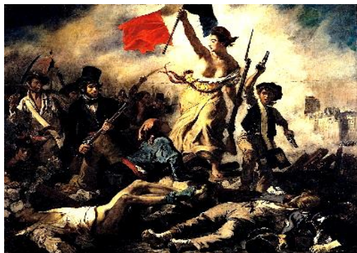
Fig. 1 – Eugene Delacroix, "Liberty"

18. Șchiopu, U. (1999). Psihologia artelor . București: Editura Didactică și Pedagogică.