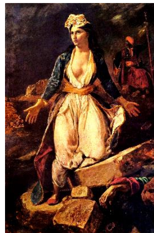
Fig. 2 – Eugene Delacroix "Greece on the ruins of Missolonghi"