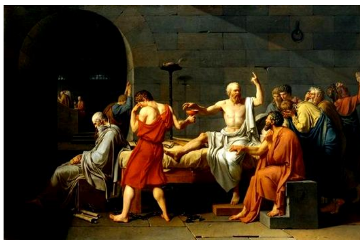
Fig. 4 – Jaques Louis David, "The death of Socrates"