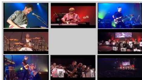
Fig. 2. A 3 \times 3 SOM obtained by using visual and disparity information.

Figure 2 illustrates a SOM lattice obtained for video 1 by using visual+disparity information where the closest training image to the corresponding neuron is depicted. As can be seen, disparity plays an essential role, since the top-left neurons correspond to shots where the camera is close to the subjects and thus are related to concepts such as ‘‘performer medium-view’’, while towards the bottom-right neurons the depth increases leading to concepts such as ‘‘stage extreme-long-view’’.