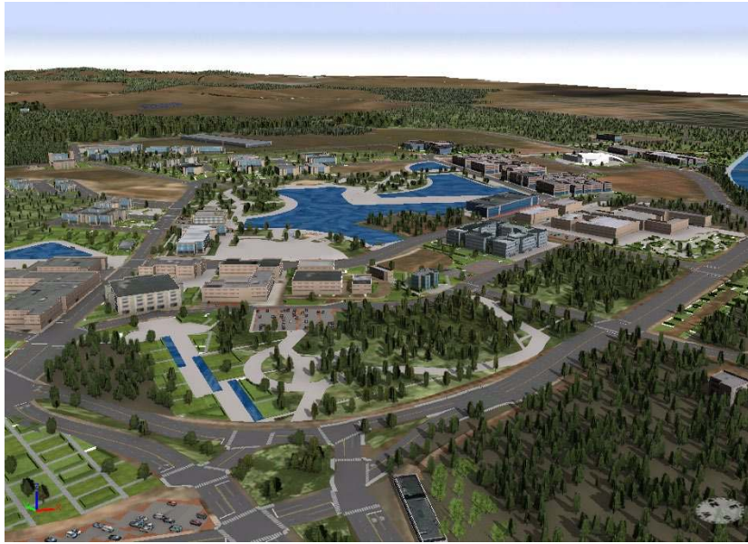
Figure 4. A general view of 3D model of the Osmanbey Campus

All of the prepared building models were exported as one model file and made ready for the Unity 3D environment and then transferred to the Unity 3D -game engine software- and rendered on the tablet screen using the Vuforia platform. When the pre-defined visual target (paper and cardboard) is detected by the tablet's camera, this target is displayed as a 3D model of the campus on the tablet screen and the details can be shown (Figure 5). The user can explore different parts of the model by rotating the tablet's camera around the visual target.