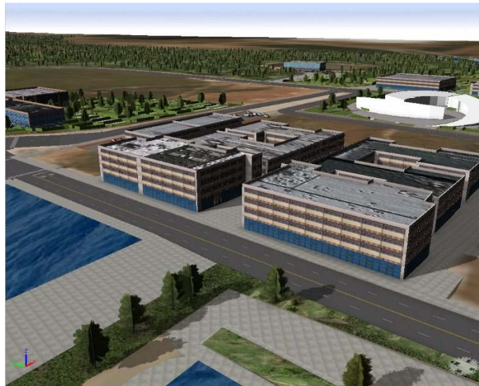
Figure 3. Some modelled buildings and their facades of the Osmanbey Campus

Infrastructure data was obtained during model creation and these data were arranged through GIS software for use in the CityEngine environment. Then the facade photographs of the campus buildings were taken by fieldwork. These photographs were used to produce the building models at the LOD2 (Level of Detail 2). To take advantage of the procedural modeling technique of the CityEngine software, .cga files were prepared by writing proper codes in the software for the creation models. With these codes, the buildings belonging to the campus area were modeled according to their characteristics (Figure 3). The surfaces of the modeled buildings are covered according to the building types. The windows, doors, etc. that are not in the correct position during this process are arranged in "cga" codes. To ensure that the model is suitable for VR/AR applications, the model is prevented from being in a multi-part structure. Finally, this model is ready for use in VR/AR applications.