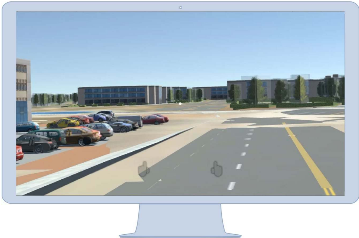
Figure 6. An example view of VR application which user see from the VR glass

AR application was presented to young students in the high school and their equivalent age groups as a workshop in the Sanliurfa Science Festival organized within the scope of a project funded by The Scientific and Technological Research Council of Turkey (Tubitak No: 4007). Within the scope of the workshop, students from different high schools discovered the 3D campus model of Harran University with the application of augmented reality. The students were able to examine the Osmanbey Campus, which is 25 km away from the center of the city, in an interactive way on the tablet screen.