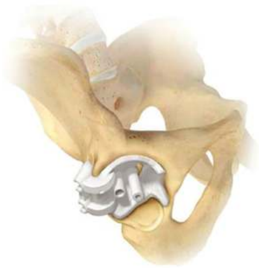
Figure 3: Image showing the Signature Hip system (Zimmer Biomet). The 3D printed Primary Acetabular Guide is seated into the acetabulum, and pins are placed into the rim of the acetabulum through attached drill sleeves. The pins are left in place, and the guide is removed. These pins can act as either a constrained or nonconstrained guide to reaming of the acetabulum and placement of the implant.