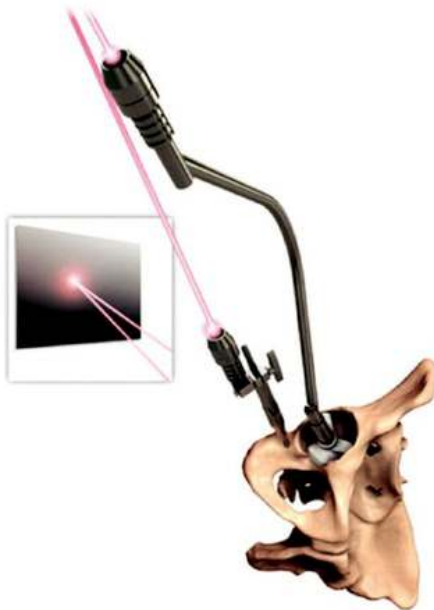
Figure 2: Image showing the OPS system (Corin Group). A guide and acetabular model are created for each patient. The soft tissue in the acetabular fossa is excised, and the guide is inserted and compared with the 3D printed model to confirm accurate seating in the acetabulum. A laser handle is attached to the guide to focus a laser onto the operating room wall. A second, pelvic-mounted laser is then directed to match this point on the wall. Use of this second laser allows for maintenance of the laser point while reaming the acetabulum. The implant introducer has a laser attachment, which has to line up with the pelvic-fixed laser on the wall to ascertain the correct inclination and anteversion of the implant. The 3D printed model can also be used to demonstrate the expected overhang of native bone as a second check of correct implant placement.