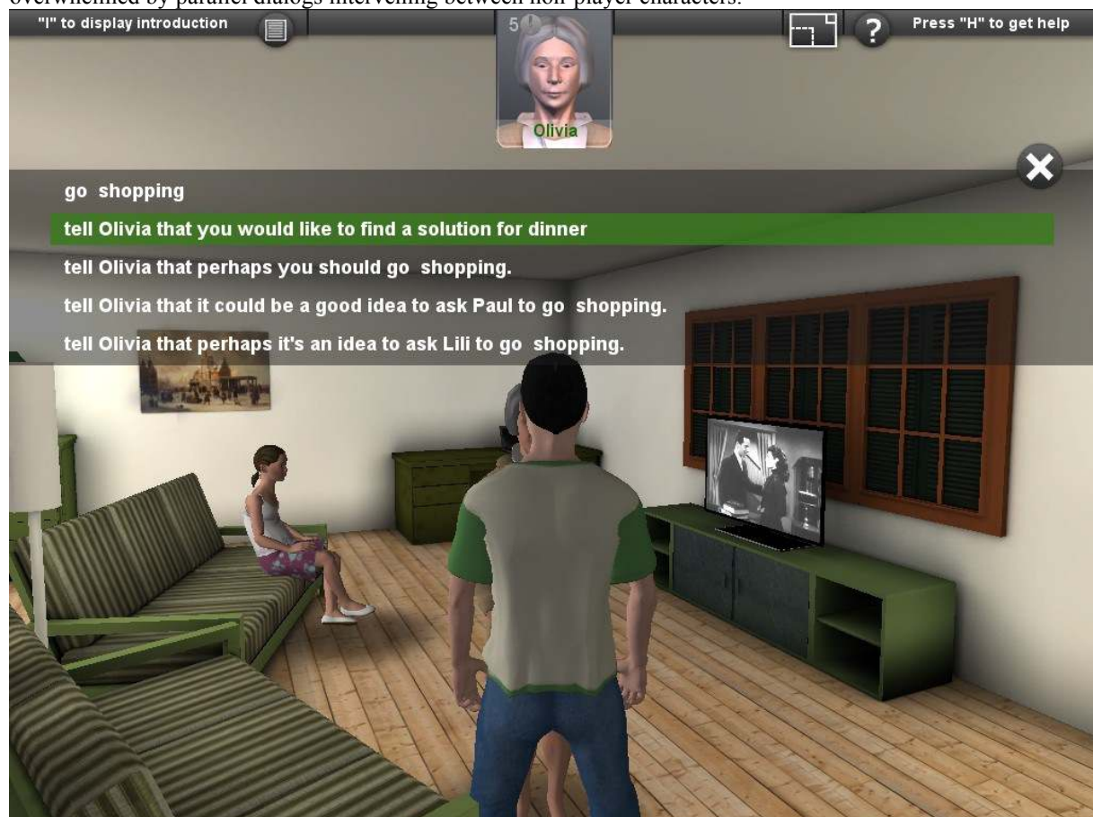
Figure 1: The user interface when interacting with a NPC

To design a user interface (UI) for an interactive drama is challenging. The UI needs to offer many possible choices (e.g. 10-15), while remaining unobtrusive, in order to favor immersion. Furthermore, the user risks being overwhelmed by parallel dialogs intervening between non-player characters.