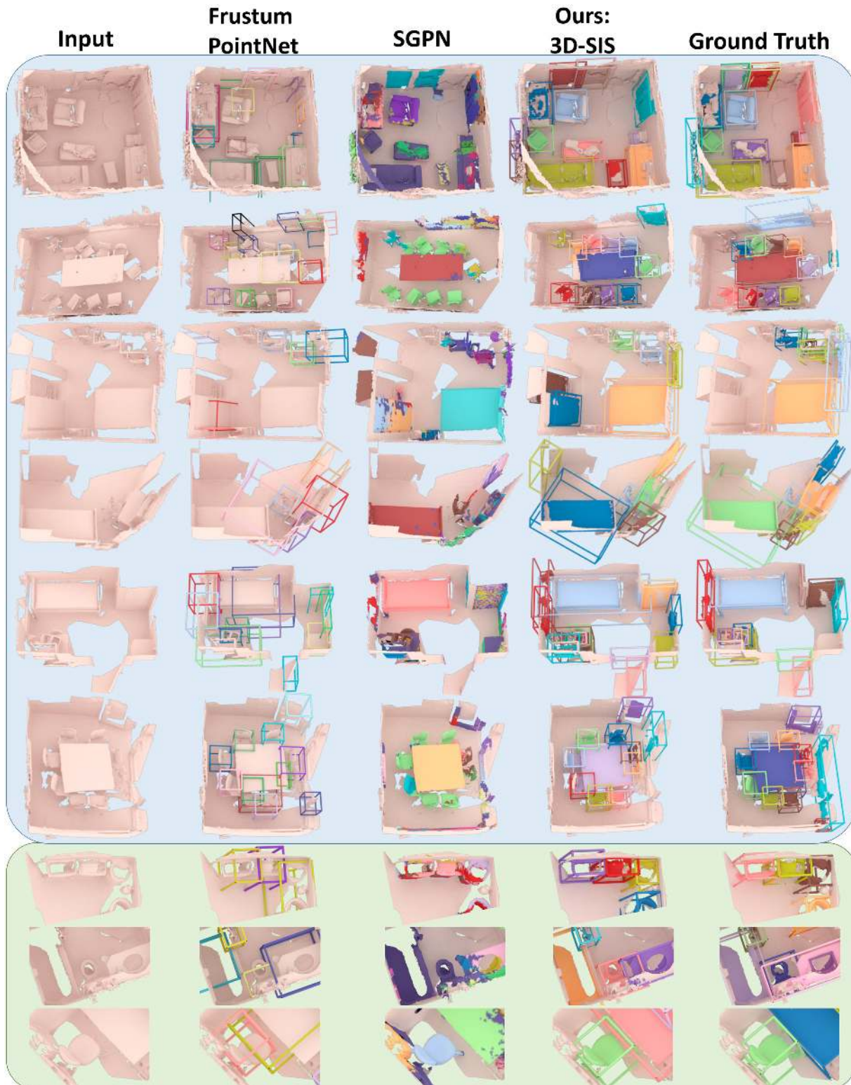
Figure 3: Qualitative comparison of 3D object detection and instance segmentation on ScanNetV2 [5] (full scans above; close-ups below). Our joint color-geometry feature learning combined with our fully-convolutional approach to inference on full test scans at once enables more accurate and semantically coherent predictions. Note that different colors represent different instances, and the same instances in the ground truth and predictions are not necessarily the same color.