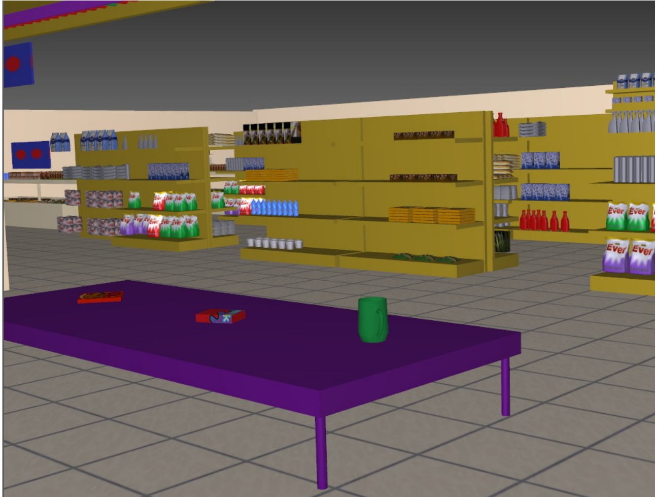
Figure 1: The Sample Supermarket

model, we developed a supermarket model that was exported to VRML, one of the most common open formats nowadays, with the hope that such a model could be easily readable from any tool contestants may use.