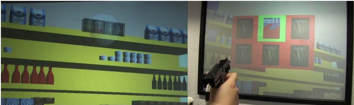
Figure 6: The spherical selection volume on the left hand side and the menu on the right hand side.

the selection technique has to be completed by pressing a button (trigger of the toy gun) which would temporarily remove all the items from the world and place them in a square menu. An item could be selected by pointing at it and again pulling the trigger, if the menu would not contain the correct items the menu could be cancelled with the second thumb button. The possible selected item will be attached to the pointer and the other items are put back into the world. We opted for a square menu because this would most efficiently make use of the effective width of the items, this has recently been investigated and proven to be a very good menu structure [1]. The menu can be seen in Figure 6. To make sure that the visibility of the items inside the menu is optimal they are resized and rotated to nicely fit inside an item.