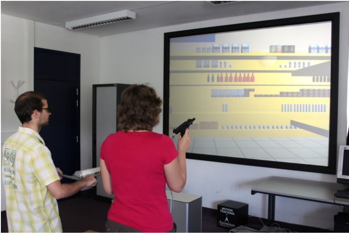
Figure 4: Overview of the setup of the video contest winner.

selection and manipulation a toy gun with built-in flock of birds tracker and two custom USB interfaced buttons (dominant hand) in combination with another flock of birds tracker attached to a glove (non-dominant hand) were used. For visual feedback a polarisation projection screen (2.4 m x 1.8 m) with passive stereo using two DLP projectors was used.