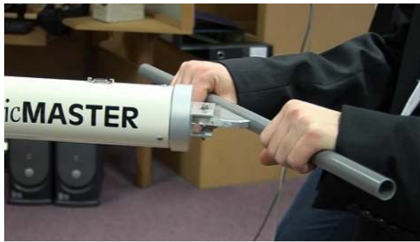
Figure 5: The Hapticmaster with shopping cart handle used for navigation.

inside a toy gun which we also provided with a trigger button and button reachable with the thumb for less often used actions. We used for our tangible prop a toy gun as this is intuitive for aiming at a screen. The tracker was calibrated such that where the gun pointed on the projection screen it could be used as an aiming point onto the 2D screen projected into the 3D world. This made pointing onto the screen intuitive. This point was visualised as a small blue transparent circle.