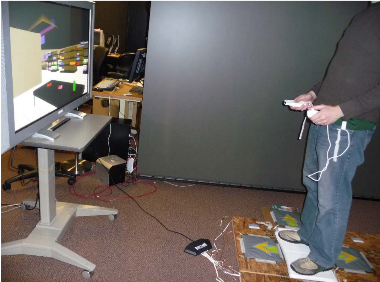
Figure 2: Overview of the setup used in the design of the live contest winner.

of creating a complete, general-purpose 3DUI from these consumer-level devices. We also wanted to determine how established 3D interaction techniques needed to change in order to accommodate such input devices while maintaining overall usability.