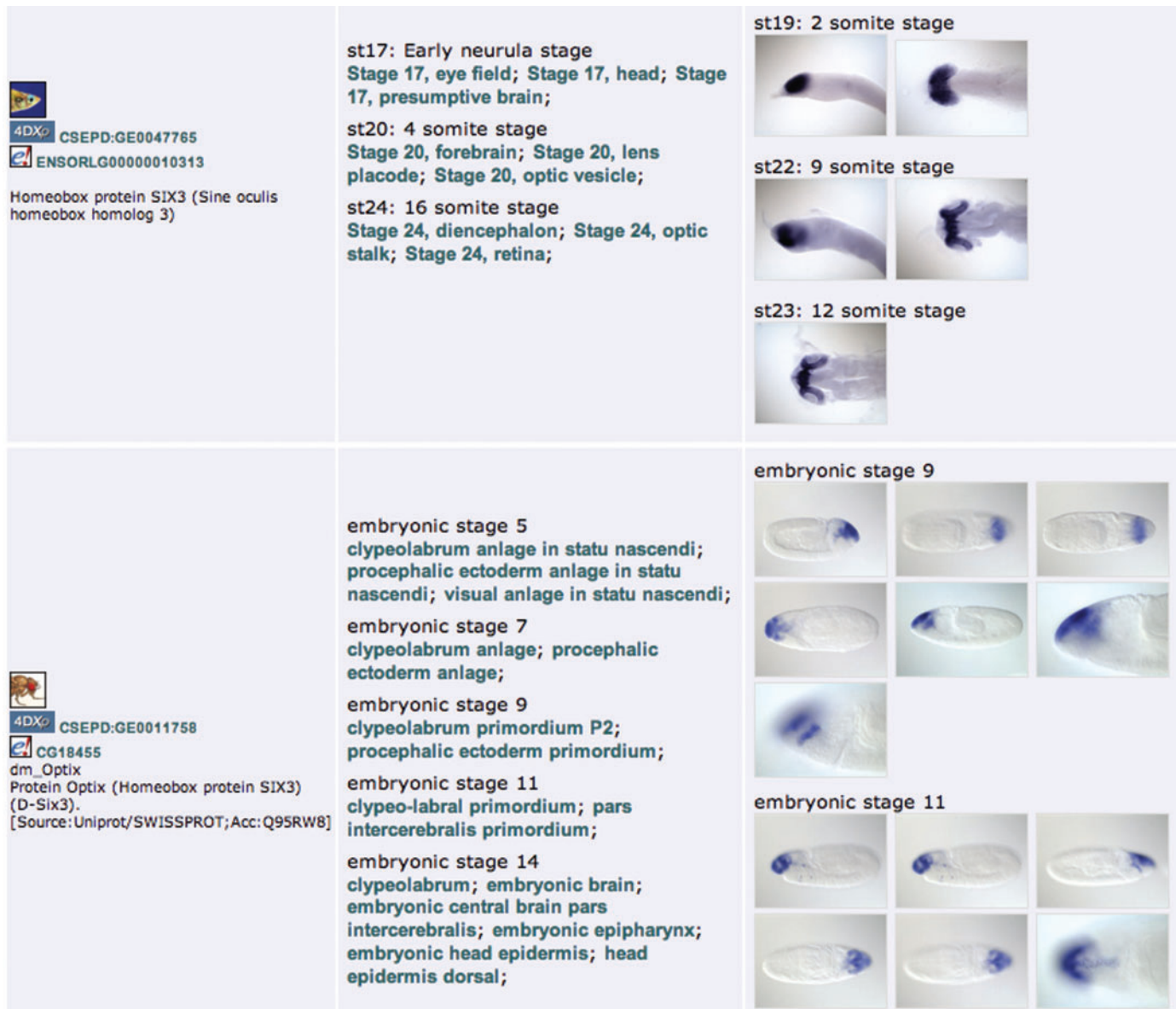
Figure 3. The comparative view shows expression patterns of a list of selected genes (medaka Six3 and its Drosophila orthologue Optix). Expression annotation and images can be easily compared between the genes on a single page.