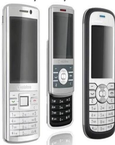
Fig.3: 2g mobile phone

2G cellular telecom networks were commercially launched on the GSM standard in Finland by Radio linja in 1991. 2G technologies enabled the various mobile phone networks to provide the services such as text messages, picture messages and MMS (multimedia messages). 2G technology is more efficient.. It was planned for voice transmission with digital signal and the speeds up to 64kbps.2G technology holds sufficient security for both the sender and the receiver. All text messages are digitally encrypted. This digital encryption allows for the transfer of data in such a way that only the intended receiver can receive and read it