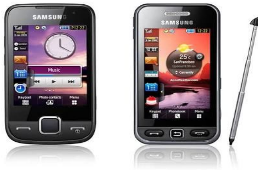
Fig.4: 3g mobile phone