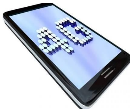
fig.5: 4g mobile phone

The basic feature of 3G Technology is fast data transfer rates. However this feature is not currently working. properly because, ITU 200 is still making decision to fix the data rates. Network authentication has won the trust of users, because the user can rely on its network as a reliable source of transferring data. . 4G is a conceptual framework and a discussion point to address future needs of a high speed wireless network. It is expected to emerge around 2010 – 2015. 4G should be able to provided very smooth global roaming ubiquitously with lower cost.