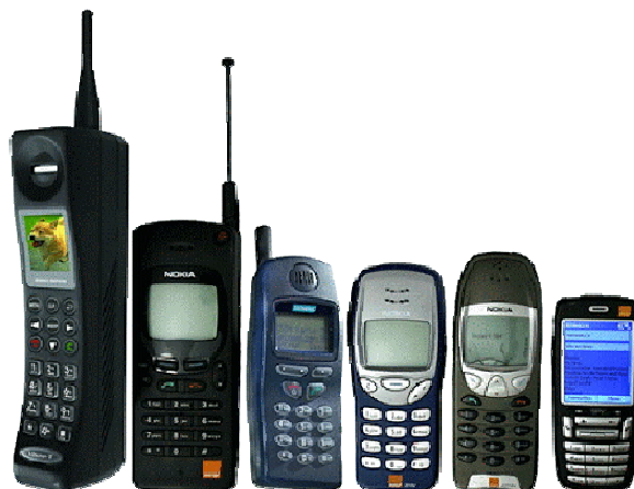
Fig.2: 1g mobile phone