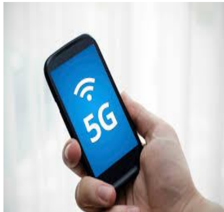
Fig.6: 5g mobile phone

could offer. There is messenger, photo gallery, and multimedia applications that are also going to be the part of 5G. There would be no difference between a PC and a mobile phone rather both would act vice versa.