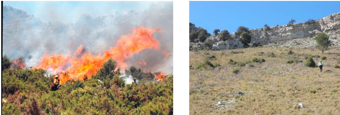
Figure 3. Tivissa plot during the first prescribed fire in 2006 (to the left) and as seen nine years later during the most recent sampling event (to the right).

this study is the same as that described for the Montgrí plot [30], comprising 42 sampling points within a plot, measuring 4 \times 18 m, within the burned area. Figure 3 show the view of the study site in 2006 and 2015. A sampling plot was established within the burned area using a grid structure ( 4 \times 18 m). Soil samples were collected after the prescribed fire at 42 points along three transects and along three lines running perpendicular to the central transect [30].