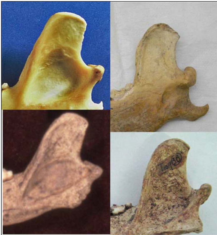
Figure 2. Coronoid process (mandible) profiles, clockwise from bottom left. Thule-age dog (<1000 years old) from Devon Island, central Canadian Arctic [17]; modern Alaskan malamute (Univ. Victoria, Canada 90/28); Razboinichya canid; and Neolithic Chinese dog from Jiahu site [31]. Many Neolithic dogs from the Middle East and North American wolves [32] have a straight profile like Arctic Thule-aged dogs illustrated on the left, while dingo and Chinese wolves [33] have the slightly hooked profile shown on the right. Prehistoric North American dogs outside the Arctic [32,33] have a profile with a more pronounced hook than the Razboinichya and Jiahu specimens above. doi:10.1371/journal.pone.0022821.g002