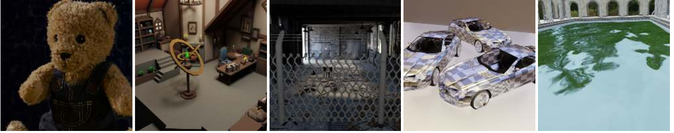
Fig. 1. A subset of scenes used for benchmarking (left to right): Large disparity : bear, sorcerers’ room, Disparity : abandoned house, Non-Lambertian materials : cars, pool. The complete dataset consists of 11 synthetic and 4 camera-captured scenes.