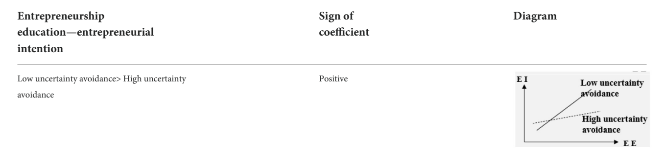
TABLE 7 (Continued)