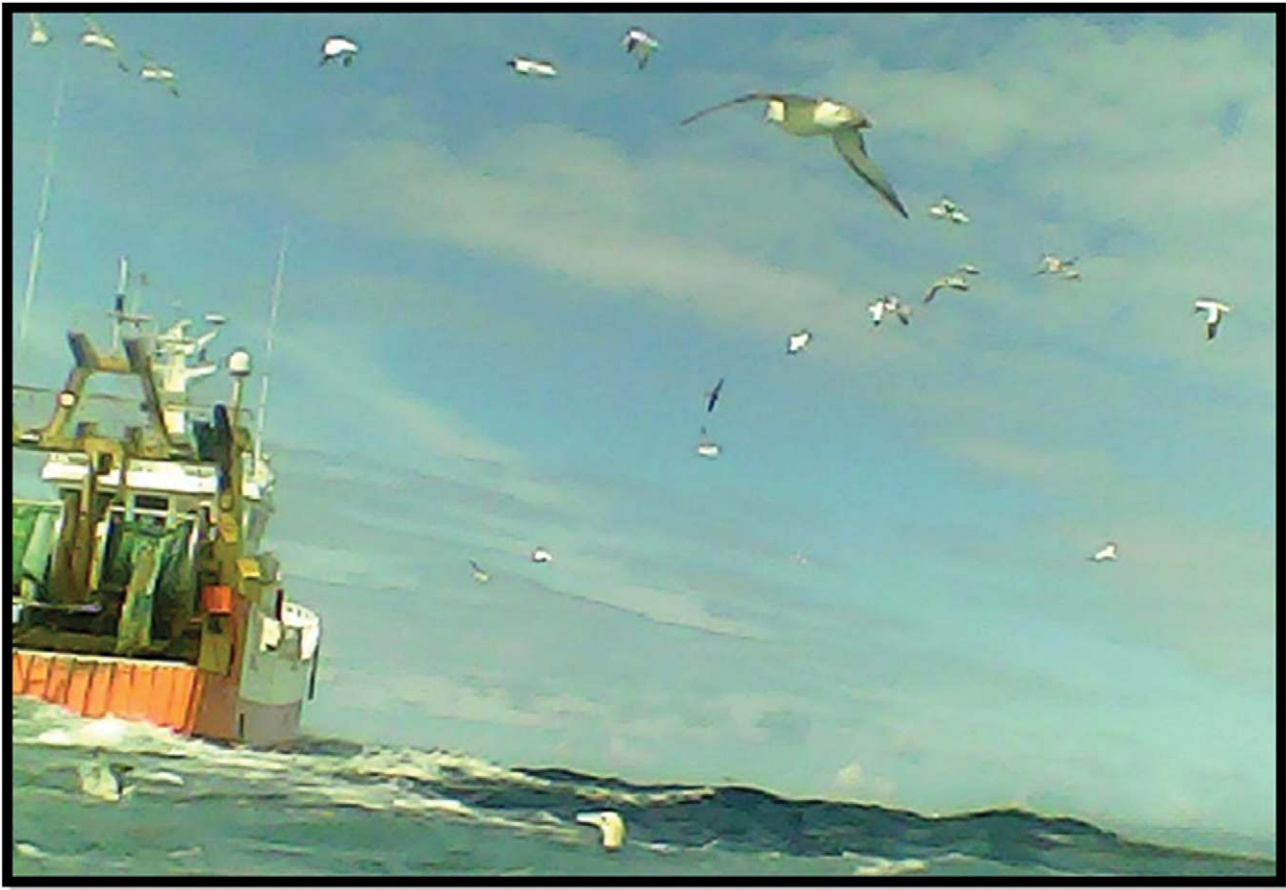
Figure 1. Bird-borne cameras reveal seabird/fishery interactions. All tracked gannets photographed fishing vessels, often in the company of large groups of other scavengers. doi:10.1371/journal.pone.0057376.g001

seabirds and fisheries at meso [17] and sub-mesoscales [15,18]. Nevertheless, even these approaches have a number of limitations: spatial overlap between seabirds and vessels does not necessarily mean interaction; vessel location data is normally gathered at a much coarser resolution than animal-borne tracking devices; gear-type information can be difficult to obtain; not all vessels are legally required to use vessel monitoring systems; and illegal, unreported and unregulated (IUU) fisheries may have significant ecological impacts but remain virtually impossible to monitor [19].