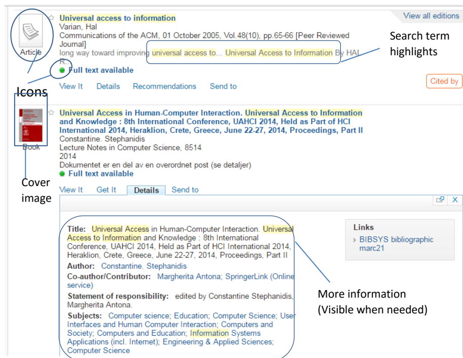
Fig 2. A snippet of search result list for “universal access to Information.”

The “details” link included with each title leads to detailed information, such as the publisher, date of publication, series, and other descriptions about the resource. Usability studies regard these as important for comparing search results, but they mention metadata inconsistency as a problem [22]. On the other hand, these could be “too much information” for users with cognitive and other forms of print disability [17].