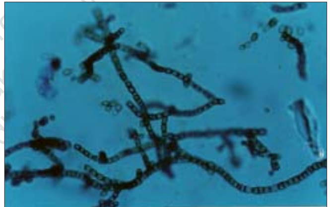
Figure 4: Microscopy of Cladosporium (Lacto phenol cotton blue mount X400) in culture colony showing long branched chains of acropetal one celled, smooth walled lemon shaped conidia

Trauma was the major predisposing factor in our study (44.66%), which was followed by diabetes mellitus (10%) and peripheral vascular disease (1.66%). Also, males comprised the larger group of patients who gave a history of trauma. Since in our society, the male still handles the traditional role of the provider, this could make him more liable to trauma. A mechanically damaged nail provides the ideal medium for fungal organisms to invade easily and thrive. Impaired blood supply and associated neuropathy in diabetes favor fungal growth.