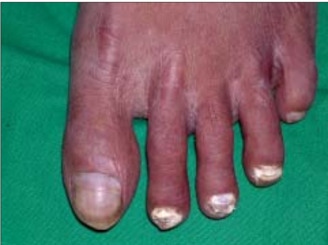
Figure 2: White superficial onychomycosis

years) [2] and Herranz's studies (mean age 37 years). [10] This could be due to increased exposure to occupational trauma, and to fungal pathogens with age.