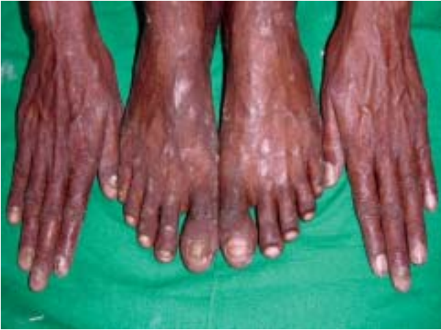
Figure 1: Total dystrophic onychomycosis with tinea pedis and tinea corporis