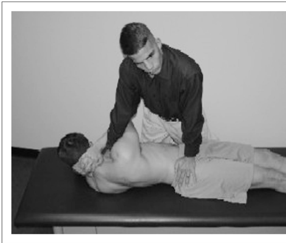
Figure 1. Manipulative intervention used in developing and validating the spinal manipulation clinical prediction rule.