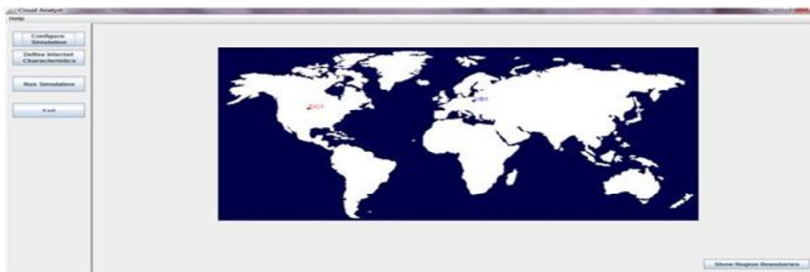
Figure 1. Cloud Analyst Main GUI Window

CloudAnalyst Simulator: Cloud computing provides computing resources as a service over a network. As speedy function of this emerging technology in real world, it becomes more and more vital how to evaluate the performance and trust management problems that cloud computing confronts. Currently, modeling and simulation technology has become a useful and powerful tool in cloud computing research community to deal with these issues.