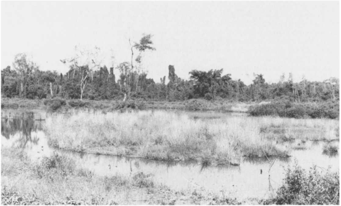
The new lake system, backed by degraded mangroves.

shallow interconnected lakes, each with a perimeter channel 1–1.5 m deep to prevent access by man and stray dogs. Most of the remaining water area is less than 0.3 m deep. Islands were constructed of spoil, covered by heavy duty polyvinyl plastic and by shell grit. More spoil was used up in surfacing an access road for maintenance. The favourable soil type has not led to acid sulphate conditions in the lake, which was filled by pumping from an adjacent Irrigation Department canal.