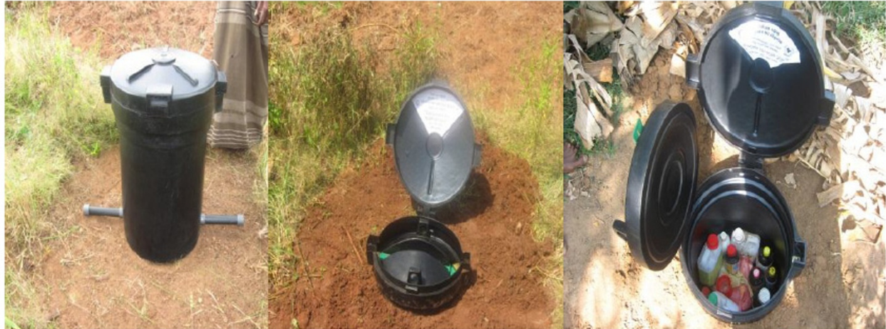
Figure 3 Safe storage device for agrochemicals in Sri Lanka. The UV-resistant plastic pesticide storage container to be used in this study. A) Device before installation: the metal bar at the base secures the device from theft. B) Device buried with two lids to protect the padlock from weather damage. C) Device can store several large and small bottles of pesticides.

pesticide self-poisoning, both fatal and non-fatal, amongst villagers aged 14 years or older, over the three-year study period. Secondary outcomes will include the incidence of: pesticide poisoning in general (deliberate and accidental, all ages), self-harm (all methods, both fatal and non-fatal), self-poisoning (all substances) and pesticide poisoning in children (younger than 14 years).