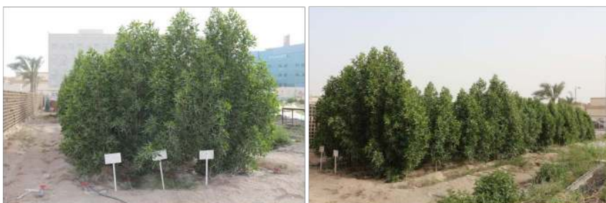
Figure 1. The growing stages of the Conocarpus erectus trees in the experimental pilot area at the Arabian Gulf University, Bahrain.