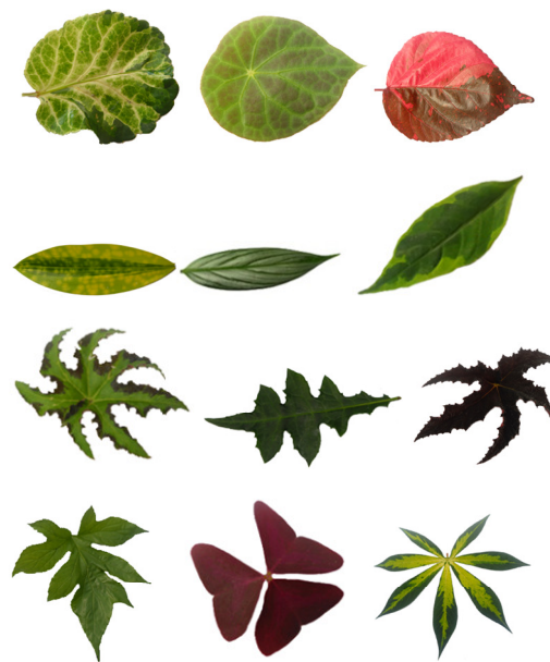
Figure 4. Sampel of leaves

There were 50 kinds of plants with various colors and shapes used in this testing. All leaves came from our collection. Several of them have variegated leaves. Figure 3 shows the example of the leaves.