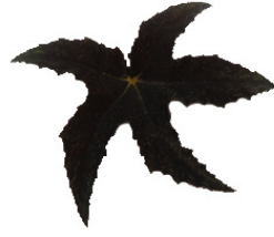
Figure 2. Leaf with irregular shape

The Eq. 3 defines the ratio between the radius of the maximum circle enclosing the region and the maximum circle that can be contained in the region. Therefore, the measure will increase as the region spreads. However, dispersion has a disadvantage. It is insensitive to slight discontinuity in the shape, such as crack in a leaf [14].