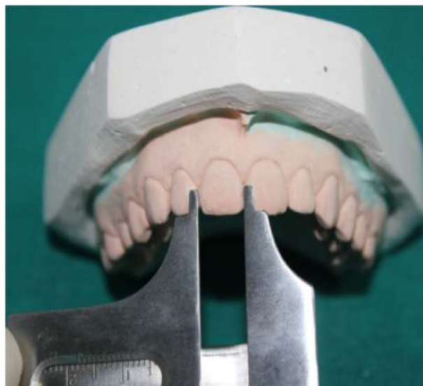
Figure 1 Measurement of mesiodistal width of central incisor.

Inclusion criteria were >18 years old; either Aryan or Mongoloid; born in Nepal; with an Angle Class I molar relationship, pleasing profile, and intact morphologically normal permanent dentition up to the second molar. Subjects with a history of orthodontic treatment; a Class II or Class III molar relationship; gingival inflammation and hypertrophy in the upper anterior region; severe attrition; crowns or proximal restorations placed in the anterior teeth; and a history of congenital anomaly, orbital disease, trauma, or facial surgery were excluded.