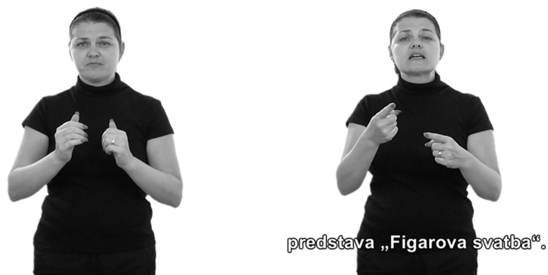
Fig 1. Two examples of the use of sign language interpreter videos on a website. (a) Sign language interpreter video without captions. (b) Sign language interpreter video with captions.

Secondly, only a few studies have investigated the effect of using captions in signing content. It was found that the presence of captions in video clips together with a sign language interpreter has a positive effect on deaf learners' understanding of the content of educational material [23,24]. In line with that, the Federal Communications Commission (FCC) will require