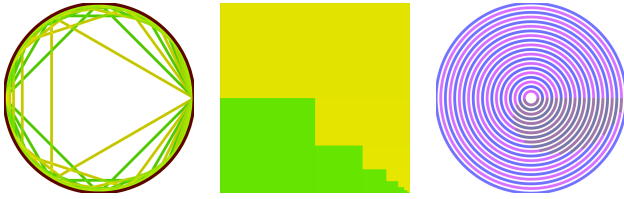
Figure 2: Graphics Benchmark

Consisting of polygons (left), rectangles (middle) and arcs (right).