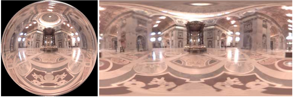
Figure 1: Left: the light probe image is based on a cropped image of a reflective sphere. Right: light probe images are omni-directional, i.e., cover the entire sphere around the light probe position. Here we have remapped the light probe image to longitude-latitude format, where the full 360 degrees are represented along the horizontal (longitude) axis, and 180 degrees are represented along the vertical (latitude) axis. For construction and remapping of light probe images we use HDRShop 2.09, [7].