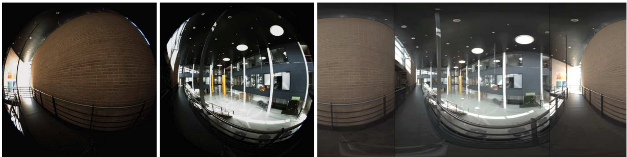
Figure 2: Left and center: two hemi-spherical images acquired with a Sigma 180 degree field-of-view fish-eye lens in opposing directions. Right: the two semi-spherical images merged and mapped as a longitude-latitude light probe using HDRShop 2.09, [7].

point. Each pixel in the map corresponds to a certain direction and solid angle, and together all pixels cover the entire sphere around the acquisition point. A light probe can thus also be called a radiance map, or an environment map. With this information virtual objects can be rendered into the scene with scenario consistent illumination e.g., [3, 4, 8]. Light probes can also be used to estimate the reflectance distribution functions of surfaces from images, as demonstrated in [15, 14]. For a review of illumination models in mixed reality see [9].