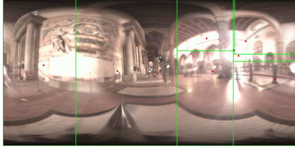
Figure 3: Result from running the Median Cut approximation technique using 8 directional sources on Galileo’s Tomb light probe. The light probe is obtained from [2]. Each rectangular region contains a red dot. This red dot marks the chosen direction for a particular directional source, and all the combined radiance from the region has been transferred to this particular source direction.