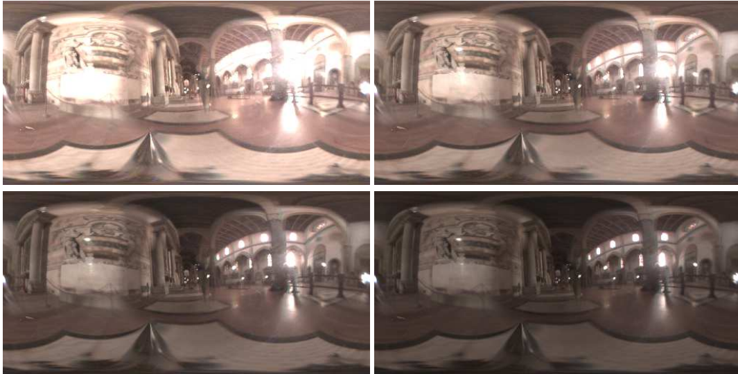
Figure 5: The tested light probe: Galileo's tomb in Florence, Italy. Acquired from [2]. Here shown in four different exposures to illustrate dynamic range.