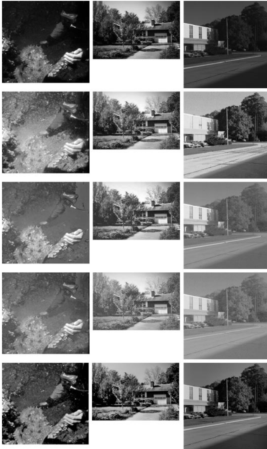
Figure 3: A comparison of the MSRCR with point operations. Top row: original; second row: histogram equalization; third row: gain/offset; fourth row: gamma non-linearity; bottom row: MSRCR