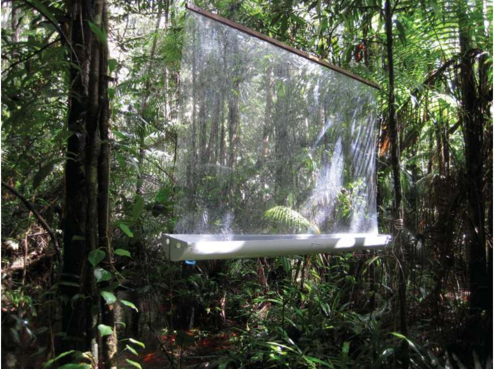
Figure 2. Picture of the modified windowpane trap described in this study (Lamarre G).