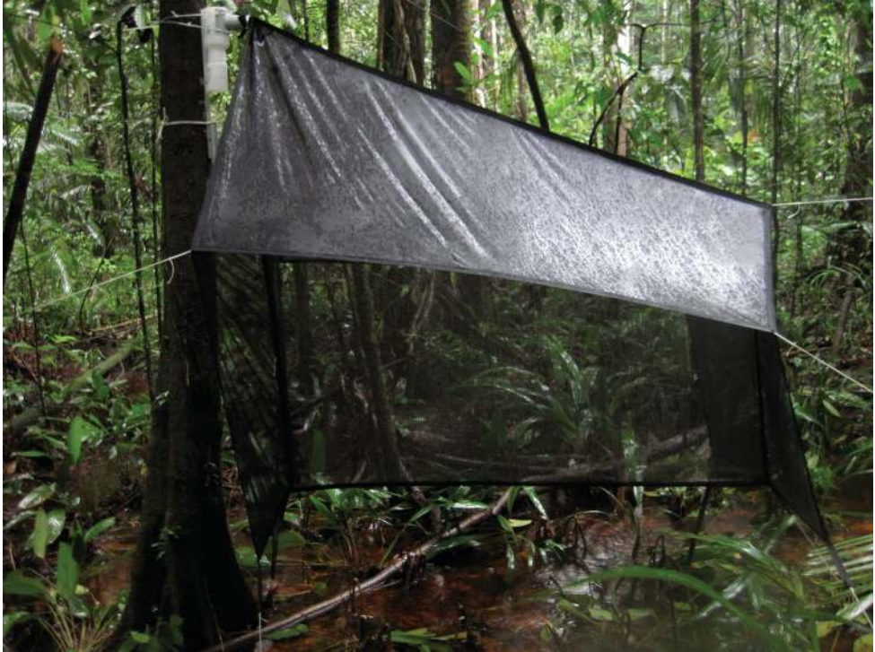
Figure 1. Picture of a malaise trap installed in a flooded forest of French Guiana.

ameter of the stopper. We recommend the use of a powerful and hermetic glue to affix the stopper inside the gutter hole. Because it is made from lightweight plexiglass, our WT model is also easy to transport and to install. This type of insect trap can be built with low-cost materials. For example, in French Guiana (the most expensive country in the region), we estimate the cost per trap as 90 euros, whereas in Peru the materials to make the trap cost only 40 euros (prices verified in 2011 by the first author).