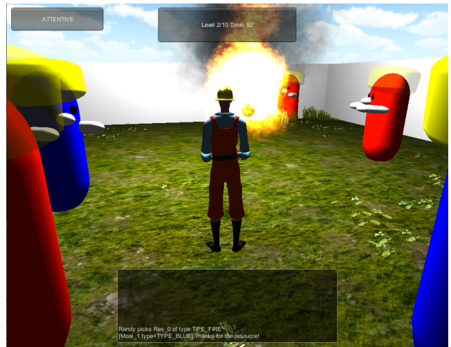
Figure 3: A screenshot of the Resource Management Game. The player character, one resource item and several NPCs are visible.

As an initial step towards our system, we developed a simple mini-game based on resource management conflicts. This game takes place in a single-player 3D environment populated by dummy NPCs and resources, in the form of fireballs, as shown in Figure 3. There are two types of NPCs differentiated by colour, reds and blues; and each has a level of happiness, ranging continuously from 1 to 0, decreasing constantly over time. Fireballs provide NPCs with happiness ranging from 0 to 1. The task of the player is to distribute fireballs among the NPCs under time constraints. The maximum score (i.e., degree of fair distribution) is obtained when the two populations of NPCs have an identical average happiness. The game is composed of 10 levels; at the end of