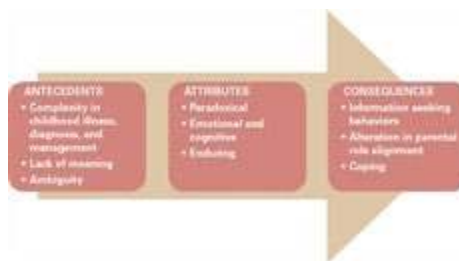
FIGURE 2.: Diagram of Antecedents, Attributes, and Consequences