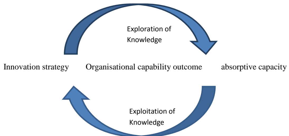
Figure 2. Organisational capability evolution through exploration and exploitation of organisational knowledge

loop between innovation strategy and absorptive capacity is the underlying mechanism upon which strategic capability can be developed. In other words, both the impact of innovation strategy on absorptive capacity, and the impact of absorptive capacity on innovation strategy have mutual roles in strategic capability development.