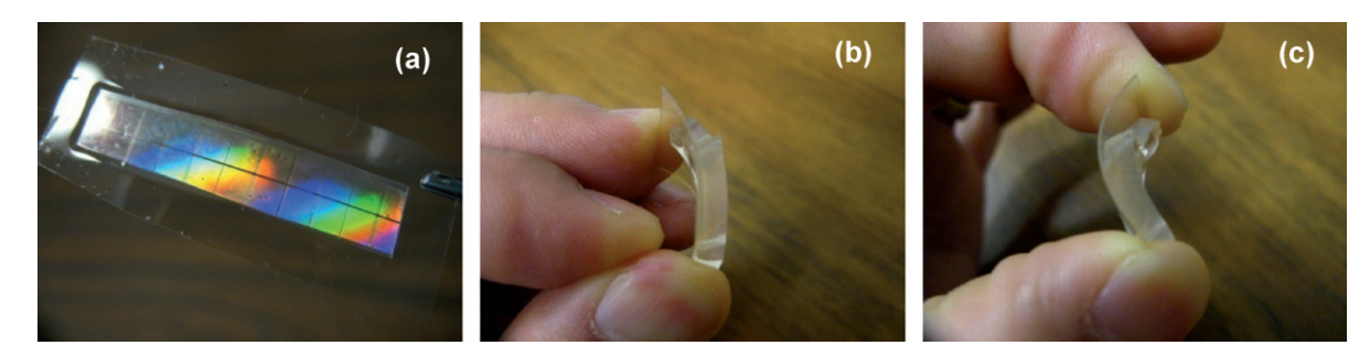
Fig. 2 Pre-patterned PU substrate bonded with PC film (a) and compressive (b) and tensile (c) stresses were applied to a test microfluidic device composed of pre-patterned PDMS substrate bonded with PET film.