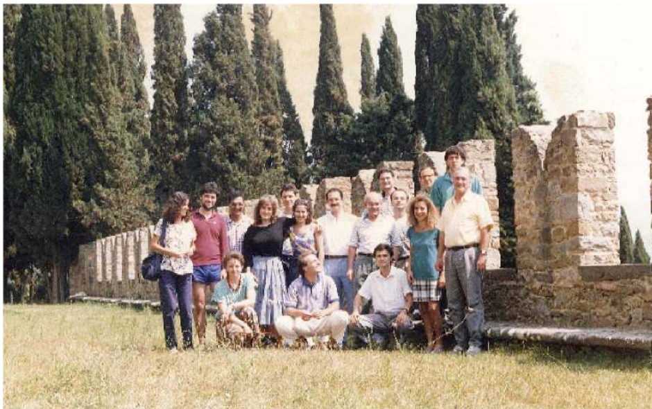
FIG. 2. Patrick Billingsley, standing in the far right, and Eugenio with some students in Cortona, Summer School, 1989.

the problem of estimating a statistical model by means of a mixture of Dirichlet processes. Such a problem was suggested by Diaconis and Ylvisaker (1985): with Slava we showed that it is possible to construct a mixture of laws of Dirichlet processes that approximates the distribution of any random probability measure, with respect to the topology of weak convergence. And we have been able to obtain, under suitable assumptions, the corresponding approximation bounds for the posterior measures. These results were presented at the 1st Workshop on Bayesian nonparametrics that took place in Belgirate (Italy) in 1997. While we were working on this paper, my mother became seriously ill and Slava has been very important in supporting me in such a difficult period.