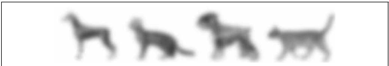
Figure 2. As long as the members of each category look similar to each other and significantly different from members of other categories, which is most often the case (Rosch et al., 1976), LFs are generally sufficient even for object categorizations (e.g., dog or cat). This supports the present proposal that LF object representations are sufficient for mediating the categorical distinctions made by PFC neurons (Freedman et al., 2001).

Context and prior expectations regarding the identity of objects are additional factors that may affect the magnitude and dynamics of top-down influence during recognition (Biederman, 1981; Palmer, 1975b). While it is suggested that a top-down process that is based on the