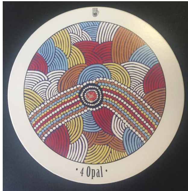
Figure 2. Rosa's imaginal product for the imaginal appropriation moment