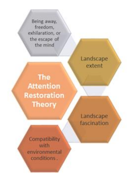
Figure 2 - The attention restoration theory elements (Kaplan, 1995)

Therefore, by identifying and enriching these components in educational spaces, the schools' open spaces, school grounds, and educational environments can be considered as supplementary, interconnected spaces. The combination of educational closed and open spaces can be used for reinforcing the students' attention and learning (Wilson, 2018).