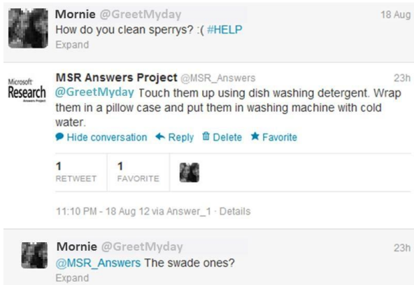
Figure 2. This user provides unsolicited feedback after receiving our system’s response, including marking the tweet as a favorite, retweeting it, and replying.

from strangers. The answers offering business recommendations to shopping questions and “how-to” instructions to technology questions were the second and third most appreciated ones. In general, answers containing more concrete information tended to receive more thanks.