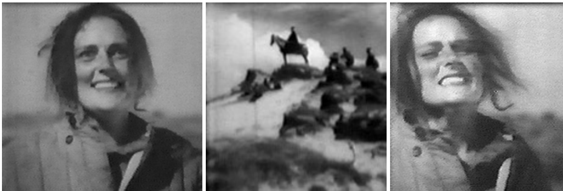
Figure 3. Sequence from Chapaev

As is not infrequently the case with socialist-realist texts, the Chapaev film was ripe for satirical engagement due to the self-parodic elements in the film itself, in particular sexual imagery. Note Anka's orgasmic reaction to seeing Chapaev on his steed, for example: