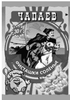
Figure 2. Chapaev Pistachio Nuts.

One of the first avant-garde film groups to form during perestroika dubbed itself Che-paev , merging the names of two martyred icons of world revolution. The list goes on: a rock group called The Chapaev Brigade; a 1998 erotic remake of the classic film (Sevriukov 2); a 1995 play by Oleg Danilov entitled My idem smotret' "Chapaeva"! [ We're Going to See Chapaev! ]. Two recent films—Petr Lutsik's Okraina [ Borderlands , 1998] and Aleksei Balabanov's Brat-2 [ Brother 2 , 2000]—explicitly use motifs from the Vasil'evs' film. Perhaps the most famous and idiosyncratic piece of recent “Chapaeviana” is Viktor Pelevin's 1995 novel, Chapaev i Pustota [ Chapaev and Void ]. 284 Vasilii Ivanovich's face has even been drafted for use on a package of pistachio nuts: