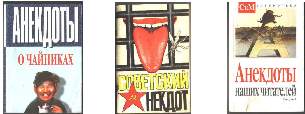
Figure 5. Anekdot Collections from the 1990s. 335

Anekdoty that Rhyme and Don't Rhyme Anekdoty about Russians and non-Russians Anekdoty from the Television Screen Anekdoty about Vovochka Black Humor [ Anekdoty about Blacks] Laughter Through Tears Literary Anekdoty