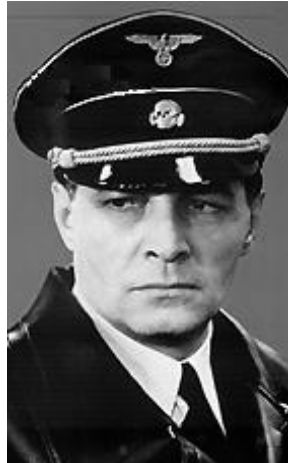
Figure 4. Shtirlits

Shtirlits is a “carrier” of Russianness abroad. 301 His Russianness is an irresistible internal force, a sort of ethnic Turette’s Syndrome.