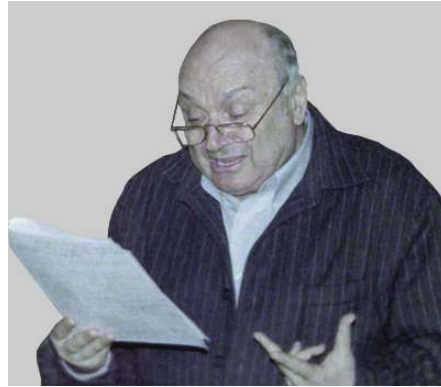
Figure 1. Zhvanetskii on Stage 196

briefcase and reading them aloud in his fast-paced, Odessa-accented patter. From a theatrical point of view, Zhvanetskii performs “naked,” without a costume or even a kostium [suit]. 195