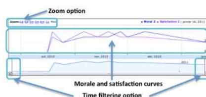
Fig. 2. Global indicator for morale and satisfaction.

In order to support the analytical process of reflexive behavior understanding, students can explore information about the way they are doing activities [17]. For example on Fig. 2, students can view the global evolution of their morale and satisfaction during the first months of the project, and navigate dynamically on this view.