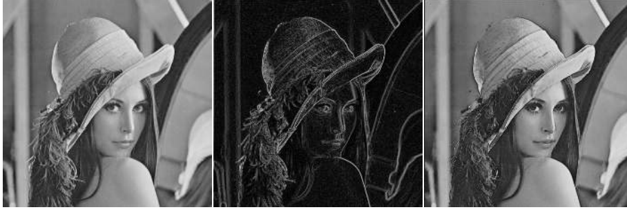
Fig. 2. From left to right: gray-level image "Lena", component J^1 , component J^3 .

(Z_1, Z_2, N_1, \dots, N_n) are given by