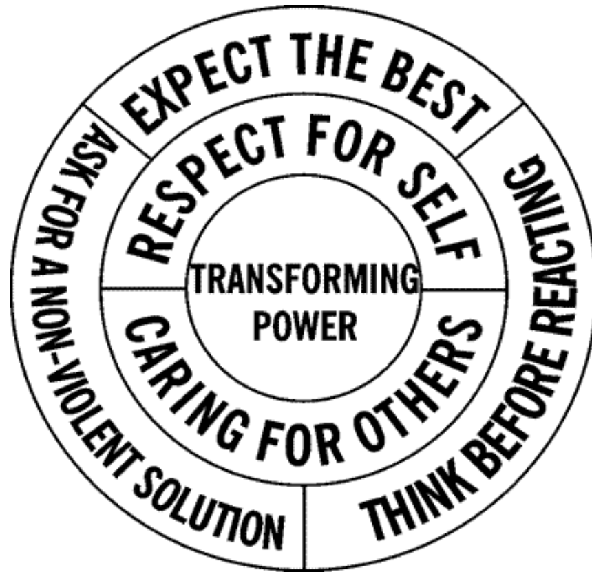
Figure 5.1 - Transforming Power Mandala (AVP/USA, 2005, p. c-6).

After being an AVP facilitator for seven years at Auburn prison in New York, I decided after many critical conversations with men at Auburn prison, that I should work with youth in secure detention facilities. With the support of AVP, Syracuse Quaker Meeting, and the men at Auburn prison, I began to do AVP workshops at Hillbrook Youth Detention Facility in 2007. In 2009, at Hillbrook Youth Detention Facility, I, with a few other adults and a group of kids in Hillbrook, created an organization named by the kids, “Save the Kids.” Save the Kids, an organization dedicated to fostering a national movement to keep kids away from violence and out of incarceration, is grounded in transformative justice. Save the Kids works with kids who are targeted by the juvenile