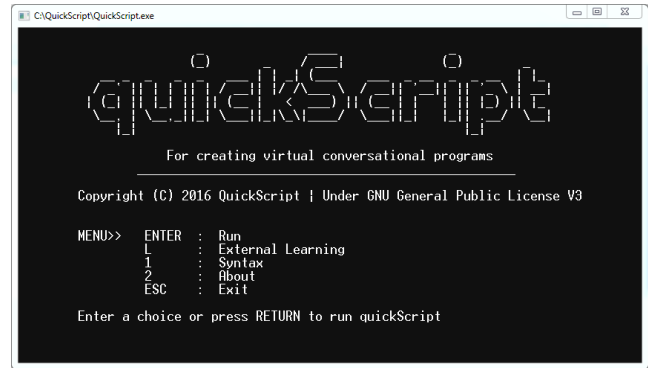
Figure 1. QuickScript Interface (in C implementation).

The internal implementation of QuickScript is in C language, and also there is ongoing development of it better versions, which will positively be available from time to time. Its syntax is minimalistic and simple and can be easily modified (upgraded) according to the user needs. These are the reasons why QuickScript can become a perfect tool to add natural language processing to IoT systems and smart appliances.