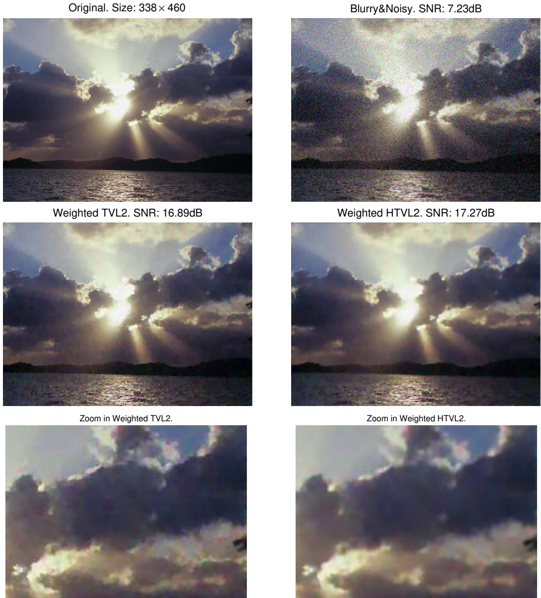
FIG. 4.5. Numerical results of weighted high order regularization. Original (upper left); Blurry and noisy (upper right); Weighted TV/L^2 result (middle left); Weighted higher-order result (middle right); Zoom in the results of weighted TV/L^2 (bottom left) and HTV/L^2 (bottom right).

and was solved by alternating minimizations with respect to u and v . For a fixed v , the minimization with respect to u involves six FFTs. However, for a fixed u , the minimization problem with respect to v is a TV denoising problem that does not have a closed-form solution. In [17], the TV denoising problem is solved iteratively by extended Chambolle's projection algorithm [5]. While the per-iteration computational complexity of our method is dominated by nine FFTs, that of [17] is dominated by the cost of solving a TV denoising problem in addition to six FFTs. According to the reported numerical results in [17], their algorithm appears to require at least as many outer iterations as ours.