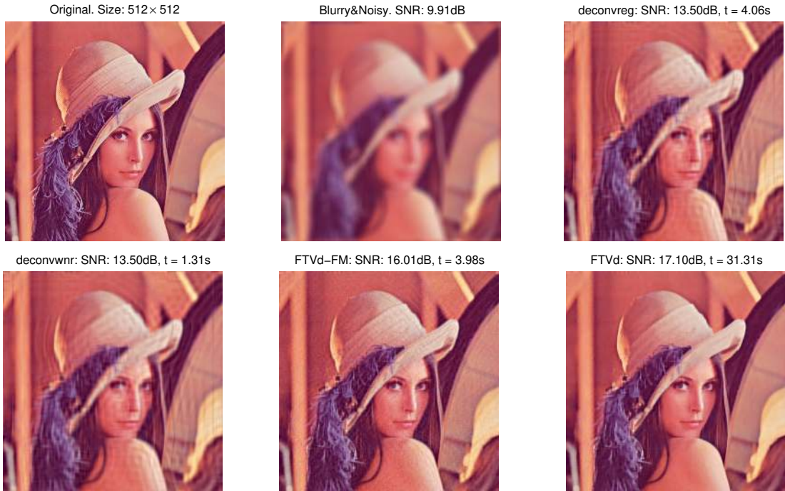
FIG. 4.2. Comparison results with MATLAB deblurring functions.

the algorithm spent much longer CPU time than “deconvreg” and “deconvwnr” just to yield an image of a similar quality.