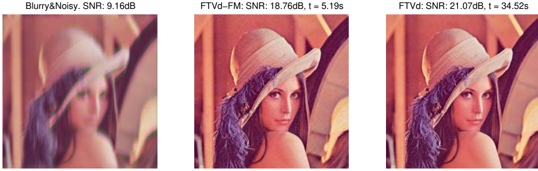
FIG. 4.3. Results recovered by FTVd-FM and FTVd from cross-channel blurring.

where \tilde{u} is an estimation of the original image and \tau > 0 is determined based on experiments. As an empirical formula, (4.1) may be far from optimal but is sufficient for our purpose here which is to illustrate that FTVd can efficiently solve the weighted model (2.5). In this test, we set \text{std} = 10^{-2} and \mu = 10^3 . The cross-channel kernels were generated in the same manner as in subsection 4.1 except that the 9 kernels used here were: