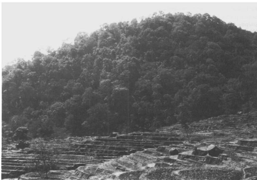
The Dieng Mountains, Central Java. A view of the lowland forests near Linggo, with areas cleared for wet rice fields in the foreground.

Asian primates (Eudey, 1987), and has recently been listed as Critically Endangered by IUCN (1996).