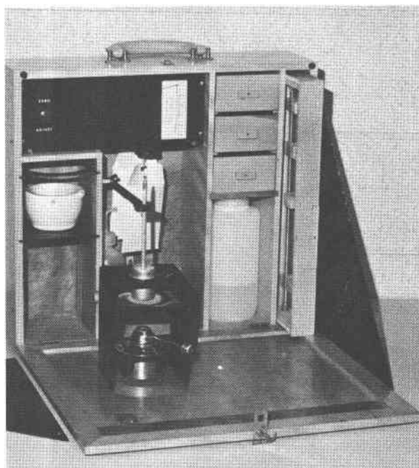
FIG. 1. Photograph of zeolite test kit.

The sample is ground in the mortar to below 14 mesh or 1 mm size. After zeroing the balance with the coin envelope suspended on the hook, 5 gm of ground sample are added into the envelope. The weighed sample is placed in the thin-walled aluminum container and heated to 350^\circ\text{C} over the burner with the mounted thermometer inserted midway into the sample (Fig. 1). When this temperature is reached, the sample container is removed with gloves or tongs from the burner, capped, and set aside to cool. For rapid cooling the sample container can be set in water. The cover is removed, and the temperature ( T_s ) of the sample is measured to within 0.2^\circ\text{C} . Ten ml of water at a temperature ( T_w ), preferably atmospheric temperature, are poured on the sample and the mixture is stirred quickly with the thermometer. The temperature of the mixture rises rapidly, reaching a maximum value ( T_{\text{max}} ) within 30 seconds, and then slowly drops to atmospheric temperature. A high temperature rise upon the addition of water is characteristic of the presence of zeolitic material in the sample, and the amount of temperature rise ( \Delta T ) is directly propor-