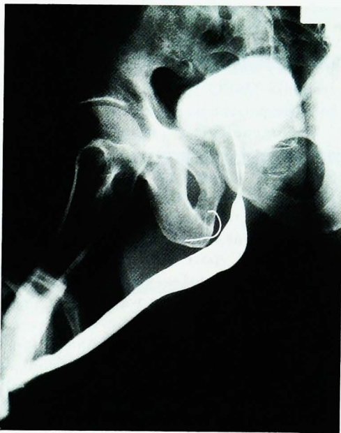
Fig. 2. Urethrography indicates that wire shadow was located outside the urethral space.