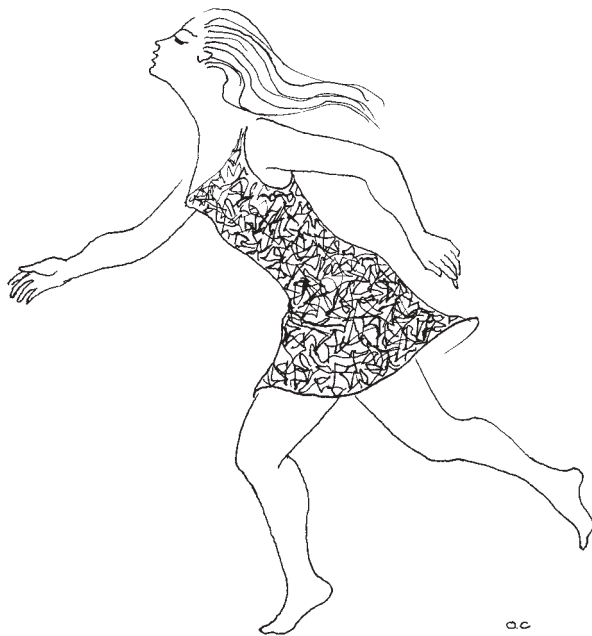
Fig. 1. The snapshot hypothesis proposes that the conscious perception of motion is not represented by the change of firing rate of the relevant neurons, but by the (near) constant firing of certain neurons that represent the motion. The figure is an analogy. It shows how a static picture can suggest motion.

broad classes: driving and modulating inputs 13 . For cortical pyramidal cells, driving inputs may largely contact the basal dendrites, whereas modulatory inputs include back-projections (largely to the apical dendrites) or diffuse projections, especially those from the intralaminar nuclei of the thalamus.