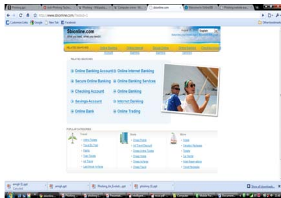
Figure:2 – Phished website of SBI

The figure 2 shows the phished website of SBI ,