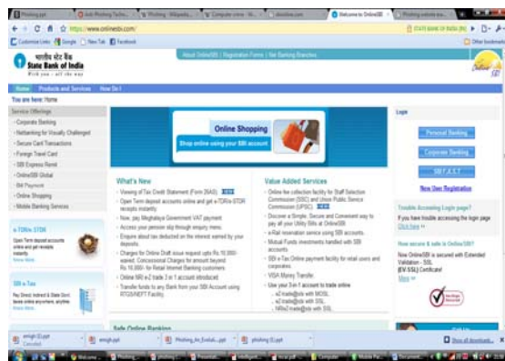
Figure:1 – Original website of SBI

The following figure 1 is the original website of SBI,