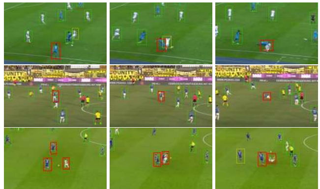
Fig. 1: An image sequence is compiled for each tracked person and their activity is classified as foul-related or not. Three samples of foul participant detections are shown here with maximum likelihood candidates in red, over threshold in yellow, and non-participants in green (each row spans 2 seconds and the images are cropped to highlight the detections)

Video-based assistance with officiating, in particular, is proliferating. The metric accuracy of high-speed, multi-camera ball tracking systems (e.g., [12]) is relied upon in many sports including tennis and volleyball for line calls, baseball for balls and strikes, and soccer for so-called “goal line technology.” In soccer, the Video Assistant Referee (VAR) [13] is commonly used for close and controversial decisions surrounding goals, major fouls, and player expulsions. However, despite the appearance of high technology, it is really nothing more than an off-field human who flags