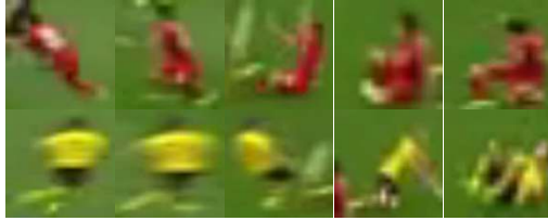
Tight tracker ROI sequence for subject (top), object (bottom) in Fig. 2