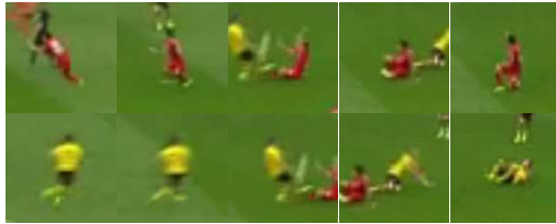
Medium context ROIs on same subject and object