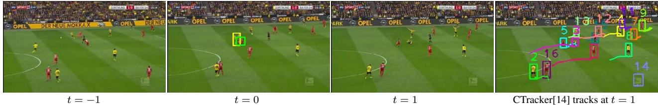
Fig. 2: A sample two-person foul with 2-second temporal context around the foul moment at t = 0 . The foul subject is denoted with a green bounding box (track 5 in the last column) and the foul object is marked with a yellow box (track 3).

ment, leaving these two questions: Who was involved in the foul, and who specifically committed it? For a full, live system, temporal event detection and foul severity classification would of course be crucial, and we will discuss in a moment how the work here overlaps with (and is therefore usable for) that task. But we argue that the foul oracle assumption is reasonable because several non-video shortcuts can simulate it—from audio detection of whistle sounds that signal fouls [16]; or, for recorded games, from mining text or audio commentary for key words (as we describe for our dataset generation in Sec. 3).