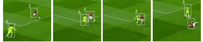
Fig. 4: Example of CTracker mistracking: Track 5 disappears when the two players come together, and when they separate, track 3 follows the wrong player. Our post-processing corrects this: One candidate track is created via a join of the truncated 5 and the “wrong” ending of 3, and another track is made via a branch from the middle of 3 to the new track 16. The complete, erroneous track 3 also remains as a candidate.

For identifying the player actions “committing a foul” and “being fouled,” we adopt the SlowFast network [25] for video recognition. To adapt this network for our spatiotemporal task, we stabilize the video around each candidate player by