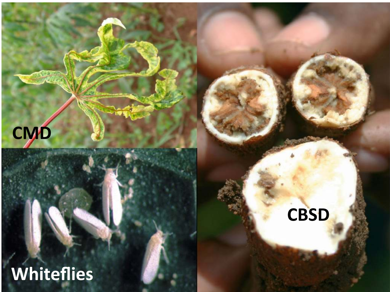
Fig. 1 Symptoms of cassavamosaic disease (CMD) ( upper left ) and of cassava brown streak disease (CBSD) ( right ), both diseases being transmitted by the super-abundant populations of whiteflies ( Bemisia tabaci ) ( lower left ).